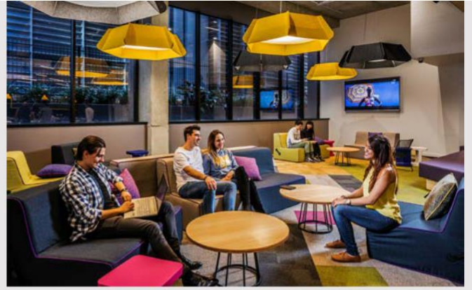
large common space to meet and relax