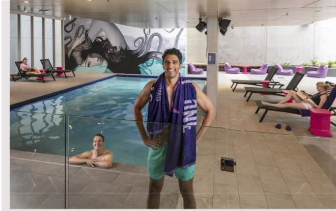
Swimming pool at Student One Wharf Street